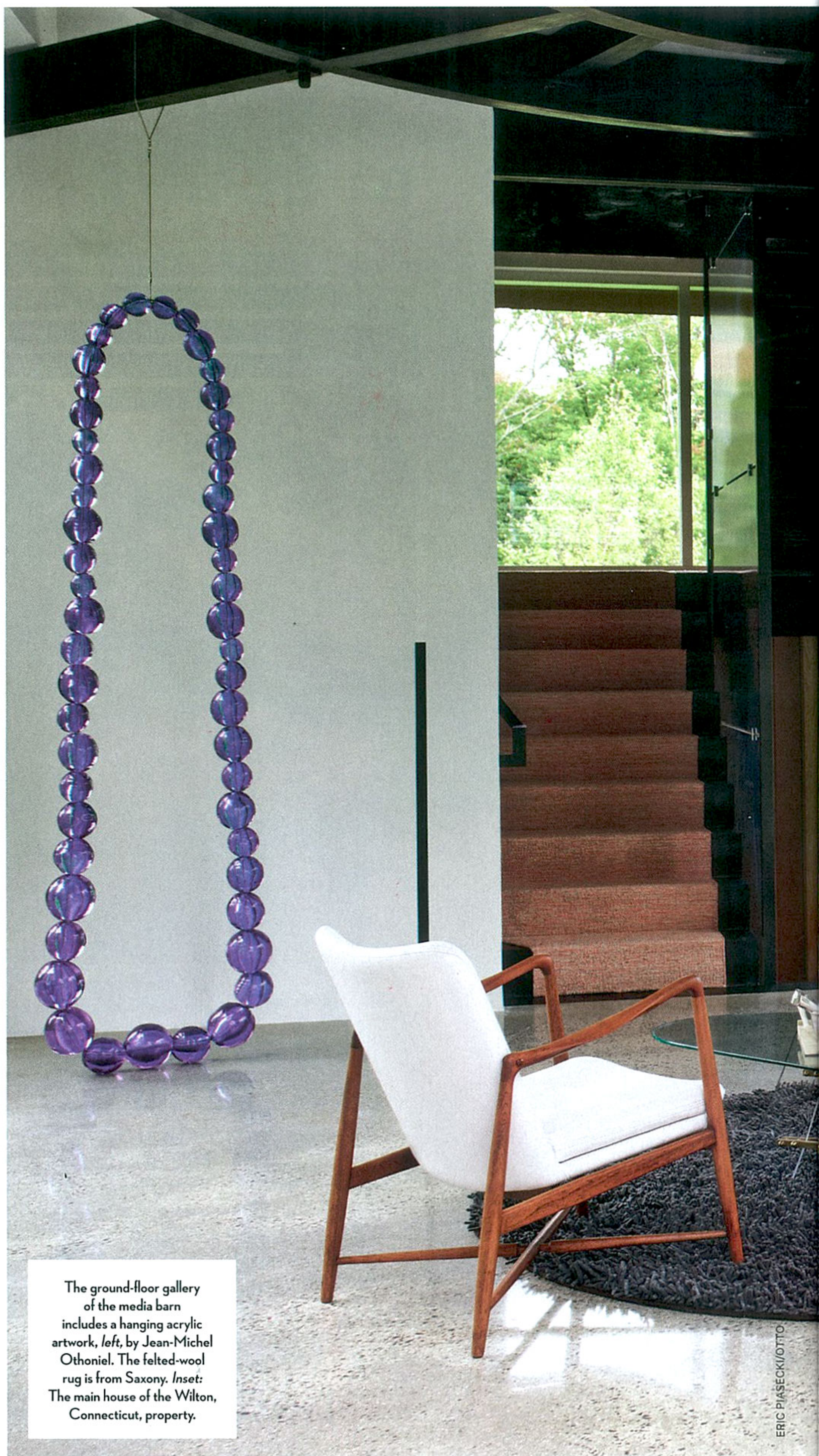
The ground-floor gallery of the media barn includes a hanging acrylic artwork, left, by Jean-Michel Othoniel. The felted-wool rug is from Saxony. Inset: The main house of the Wilton, Connecticut, property.

Bartolotta and Whitcomb used such materials as Cor-Ten steel on the exterior and waxed black steel on the interior, both of which will change and shift with the years and seasons. That rustic-looking exterior masks the unusual combination of rooms found within. It goes to show what a willing client can do to help the creative processes of architecture and interior design. "Our approach was sculptural," Bartolotta says. Whitcomb echoes that sense of freedom. The family, she says, "didn't have pre-conceived notions about what something was supposed to be." And with that freedom came something unlikely—perfectly so. ♦