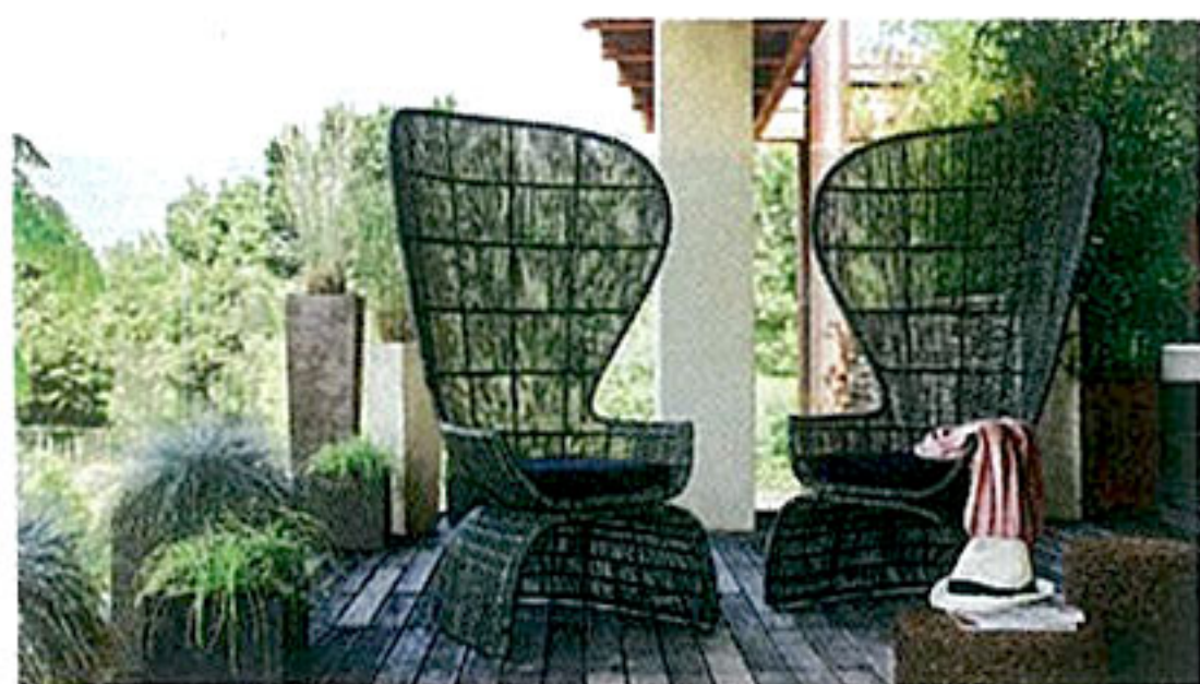
A pair of Crinoline chairs from B&B Italia, page 115