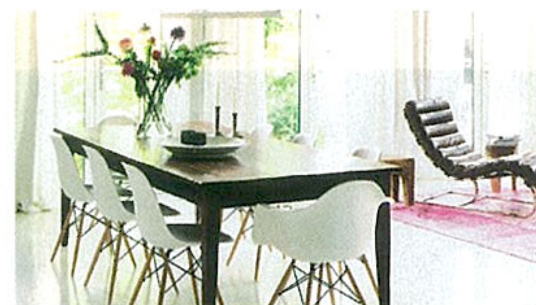
Vintage Eames molded chairs, page 136

PAGE 82 In the living room, left, vintage reproductions of Islamic shields and three copper pomegranate-shaped boxes from Orient 499, 499 Omar Daouk St., Hammoud Bldg., Mina El Hosn, Beirut; 961/136-9499; orient499.com. In the sitting room, right, vintage Le Corbusier LC2 Petit Confort sofa also available new at cassina.com; vintage Gae Aulenti Jumbo table also available new at knoll.com; blue striped fabric on the 19th-century British armchair from jennifershorto.com.