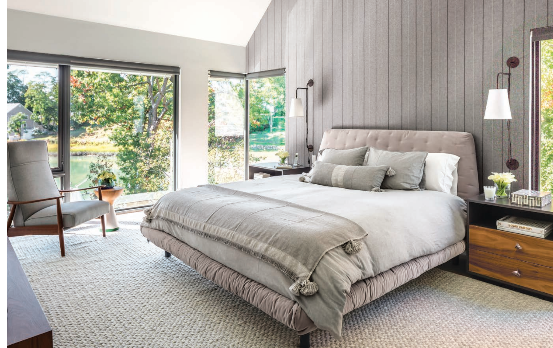
Family Life The family room (OPPOSITE PAGE) provides more doses of color, particularly in the Holly Hunt purple velvet on the sectional and the lacquered Tod side table from DDC. Maya Romanoff wallcovering is made of woven natural grasses, and the custom rug is made of New Zealand wool. Suite Spot (THIS PAGE) The master suite has a soothing and muted palette. The Milo Baughman–designed reclining chair is through DDC; sconces are through Olympia Lighting. In the master bathroom, the vanity features Kohler sinks, Waterworks faucets, and a tarnished-silver Apparatus sconce. An MTI Boutique Collection Elise tub through Torroco is fitted with Waterworks hardware. See Resources .

“When I showed the client some of these colors, she said ‘yes’ to them all. Her personality came through and so did that of the house”